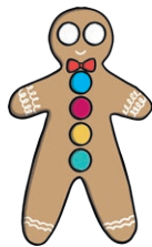
The Gingerbread Man